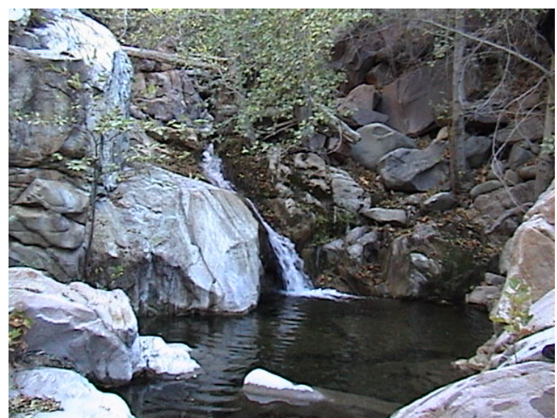
10' tall bedrock waterfall

Barrier ID: SC_MA_20 Stream: Manzana Creek Barrier Type: Bedrock Waterfall Physical Location: Approximately .4 miles upstream of Manzana Campsite at an approximate elevation of 2900' GPS Location: N 34* 44' 15.0" W 119* 52' 9.9" Ownership/Interest: Los Padres National Forest Surveyor(s) and Date: Matt and Jim Stoecker 11/20/02 and 12/15/02