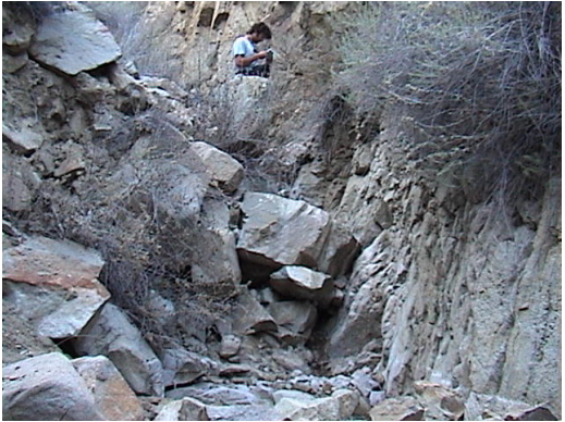
Upstream view of boulder/bedrock barrier

Barrier ID: SC_BB_1 Stream: Big Bend Creek Barrier Type: Steep Bedrock and Boulder Gradient Physical Location: Approximately 0.25 miles upstream of South Fork Big Bend Creek GPS Location: N 34* 47' 50.9" W 119* 51' 10.1" Ownership/Interest: Los Padres National Forest Surveyor(s) and Date: Matt and Jim Stoecker 12/09/02