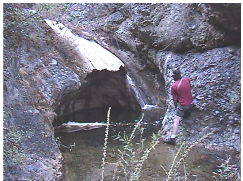
Waterfall at Turtle Bowl Creek

Barrier ID: SC_MA_TB_1 Stream: Turtle Bowl Creek Barrier Type: Bedrock Waterfall Physical Location: Approximate elevation 1700' GPS Location: N 34* 47' 2.5" W 119* 58' 18.7" Ownership/Interest: Los Padres National Forest Surveyor(s) and Date: Matt and Jim Stoecker 11/17/02