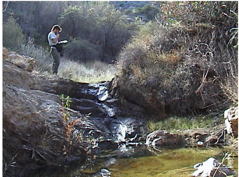
Bedrock chute looking upstream

Barrier ID: SC_BB_SF_1 Stream: South Fork Big Bend Creek Barrier Type: Bedrock Chute Physical Location: Approximate elevation 2294' GPS Location: N 34* 47' 35" W 119* 50' 51.2" Ownership/Interest: Los Padres National Forest Surveyor(s) and Date: Matt and Jim Stoecker 12/09/02