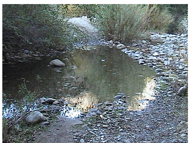
Typical In-stream Road Crossing on Manzana Creek