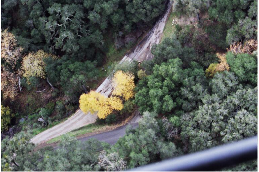
SC\_TT\_21 and SC\_TT\_22

Barrier ID: SC_TT_21, SC_TT_22 Stream: Tepusquet Creek Barrier Type: Culvert Crossings Physical Location: Approximately 1.3 miles upstream of Colson Creek GPS Location: N/A Ownership/Interest: Unknown Surveyor(s) and Date: Matt Stoecker and Jim Stoecker 12/16/02