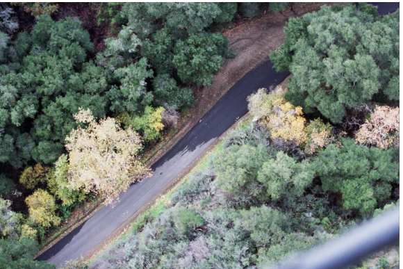
SC TT 24 (Aerial View) 12/30/02

Description: This county road crossing on Tepusquet Road consists of one 6-foot diameter corrugated metal culvert that conveys stream flows underneath. The overall length of the culvert is approximately 60 feet. The inlet and outlet of the culvert are set at streambed level and an average of 12 inches of substrate was deposited along the bottom of this large culvert.