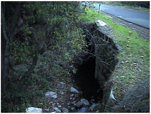
SC_TT_24 (Looking downstream) 12/16/02