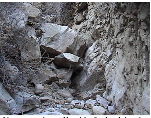
Upstream view of boulder/bedrock barrier

Description: This steep bedrock and boulder stream reach occurs in a confined canyon. Large boulders and exposed bedrock produce a nearly vertical drop with a height of 9 feet to the downstream substrate. Immediately downstream a large landslide would also likely prevent upstream migration, but this feature may flush out with high stream flows.