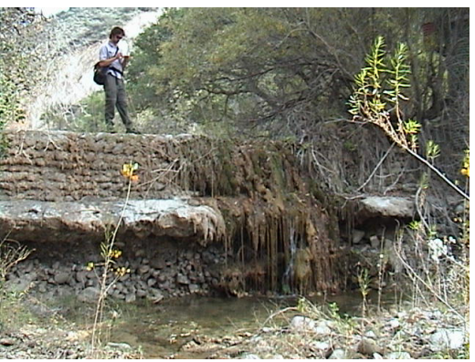
Sacrete berm on top of concrete footing

Description: This obsolete dam consists of a concrete footing that has a sacrete berm built on top. The dam height measured 10 feet 6 inches from the top of the dam to the surface of the downstream pool, which had a maximum depth of 18 inches. The dam's small, upstream reservoir is completely filled in with sediment. Kevin Cooper, Wildlife Biologist with the LPNF, thought the dam might be an old Santa Barbara County debris dam that was built after a local fire to catch sediment and/or act as a possible gaging station. The dam is not thought to serve any current purpose and does not appear to have been used to divert water.