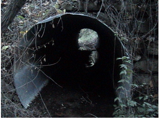
SC_TT_24 (Looking upstream); 12/16/02

Barrier ID: SC_TT_24 Stream: Tepusquet Creek Barrier Type: County Culvert Crossing Physical Location: First Tepusquet Road Crossing upstream of Colson Creek GPS Location: N 34* 56' 30.5" W 120* 13' 40" Ownership/Interest: Santa Barbara County Public Works Surveyor(s) and Date: Matt Stoecker and Jim Stoecker 12/16/02; Matt Stoecker 12/30/02